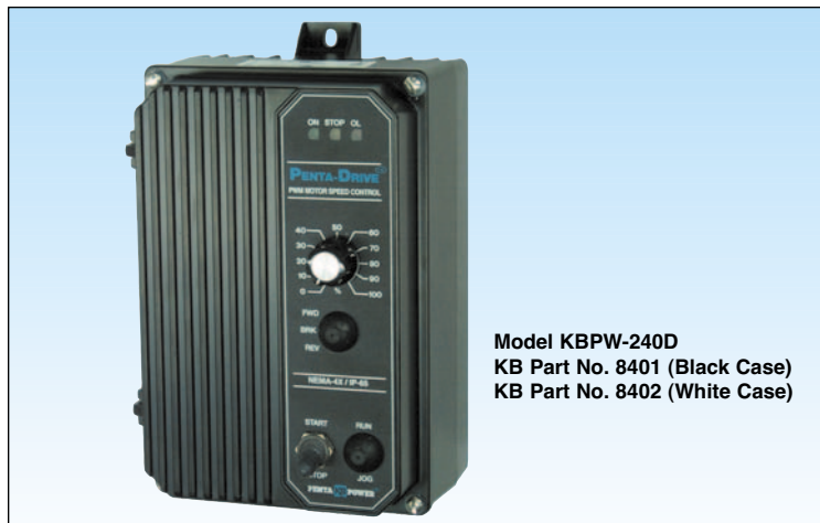
Model KBPW-240D KB Part No. 8401 (Black Case) KB Part No. 8402 (White Case)