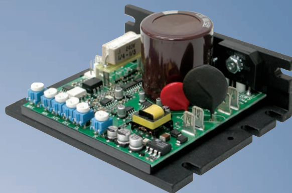
Model KBWS-15 Shown